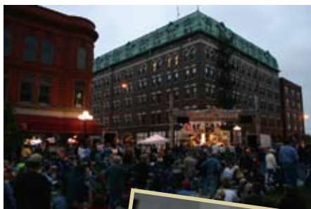
Mississippi Heat takes the stage at the 2006 GLT Summer Concert

With our now well-established GLT Night at the Shakespeare Festival, underwritten by Busey Bank, and the Recycled Music Sale, with a space made possible by Crossroads Center, these events made for a busy and "fund-filled" summer.