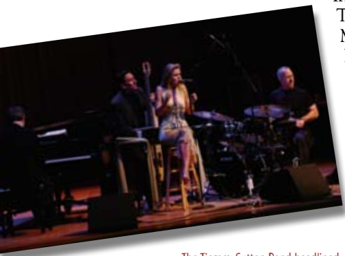
The Tierney Sutton Band headlined the 2006 Jazz Masters concert